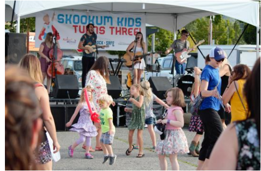
Skookum Kids Block Party