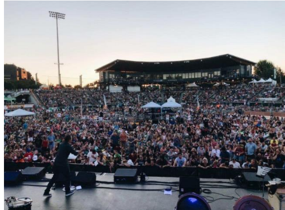
Over 9,000 attended the event in Eugene hosted by the Palau Organization and many of the churches in Eugene