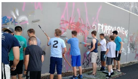
City Service Day BEFORE